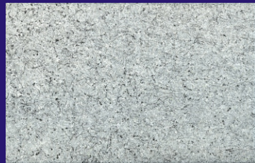
Off Gray 013