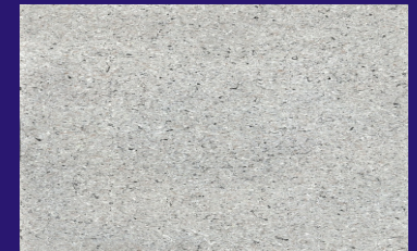
Mountain Gray 015