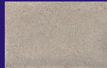
Mountain Gray 019

All colors are represented in this page to the best of our abilities. There may be slight color differences from batch to batch. Celcrete Stone finish process gives to Autoclaved Aerated Concrete (AAC) a substantial surface resistance and a beautiful lime stone finish color selections. Patent pending.