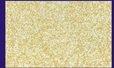
Texas Cream 005