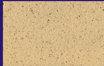
Gold Dust 012