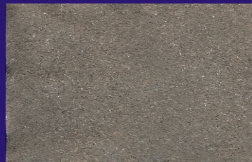
Brown Black 018