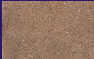
Brown America 016