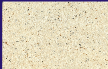
Ivory Sand 008