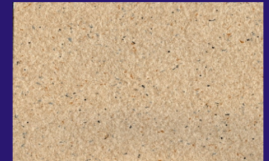
Canyon Brown 010