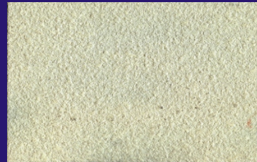
Leuders Gray 007