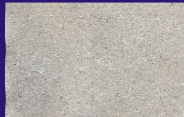
Brown Coral 017