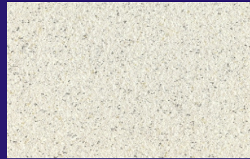
Blanco Huichapan 002